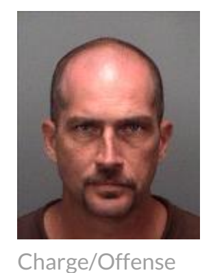
Vop Violation Of Injunction